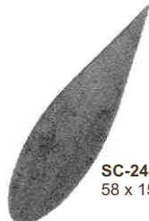
SC-24 Top Eye Plate. 58 x 15.8mm.