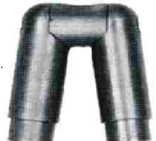
Art. 340. 16mm.