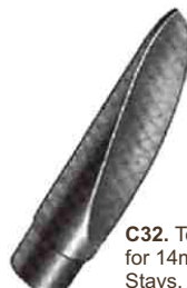
C32. Top Eye for 14mm. Seat Stays. Concave.