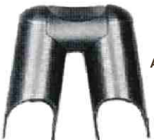
Art. 337. 14mm.