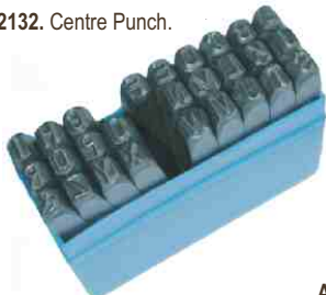
Art. 2254. Letter Punches 4 or 5mm.