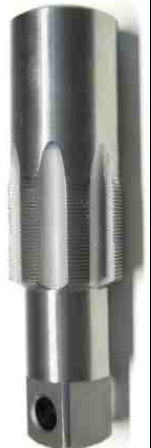
Art. 2307 or 2310. Bottom Bracket Taps. BSC or It.