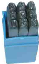
Art. 2255. Figure Punches 4 or 5mm.