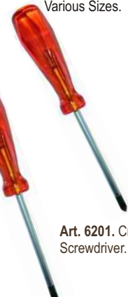
Art. 6201. Cross Slot Screwdriver. Various Sizes.