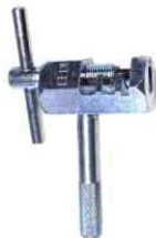
Art. 50. Chain Rivet Extractor