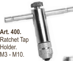
Art. 400. Ratchet Tap Holder. M3 - M10.