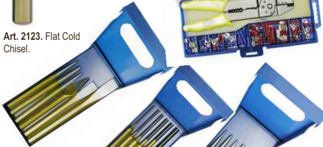
Art. 2525. Tool Set 2 Flat Cold Chisels 1 Cross Cut Chisel 2 Drift Punches 1 Centre Punch.