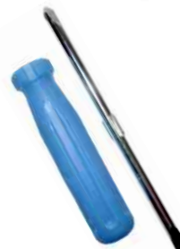
Art. 6107. Reversible Screwdriver. Slot/Cross