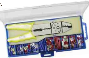
Art. 283/10. Crimping Plier Set