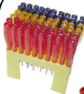
Art. 4301. Display of Small Screwdrivers. 40, 50, 60mm.